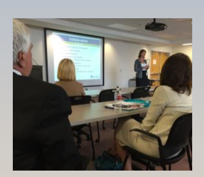
Bureau of Procurement associates attend a recent workshop presented by COSTARS, BSSO, and BVM.

Connect with COSTARS now to begin receiving updates and information! Of course, you can still contact us by phone at 1-866-768-7827 or email at (GS-PACostars@pa.gov).